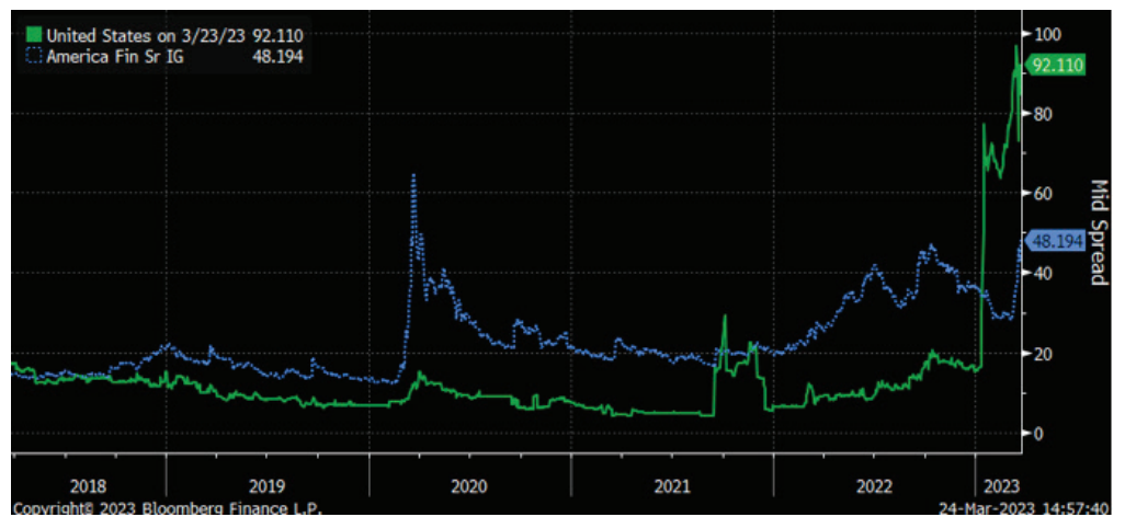
CHART 3: CDS spreads: US Government 1-Year vs Senior IG Financial Sector Bonds (Dec. 31, 2017 – Mar. 24, 2023)

Source: Richard Bernstein Advisors LLC, Bloomberg Finance L.P.