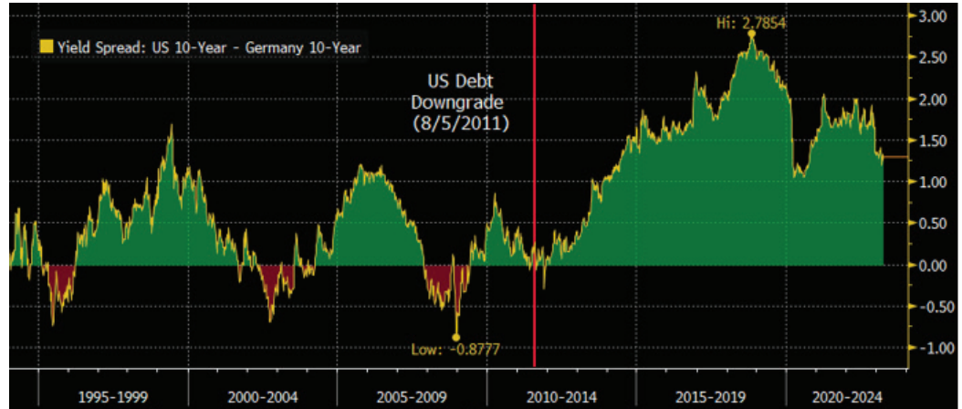
CHART 1: US 10-Year Treasuries vs German 10-Year Bunds: Yield Spread (Dec. 31, 1993 – Mar. 27, 2023)

Source: Richard Bernstein Advisors LLC. Bloomberg Finance L.P.