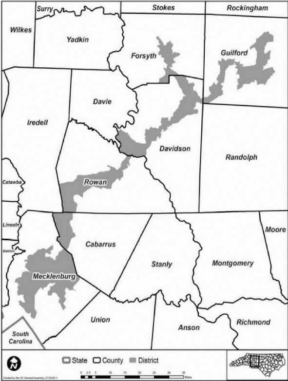
Congressional District 12 (Enacted 2011)

¶121 The United States Supreme Court described Congressional District 1 as "anchored in the northeastern part of the State, with appendages stretching both south and west[.]" Id. at 1456. It described District 12 as "zig-zagging much of the way to the State's northern border." Id. District 1 had a